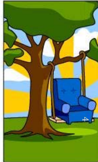
How the Business Consultant described it