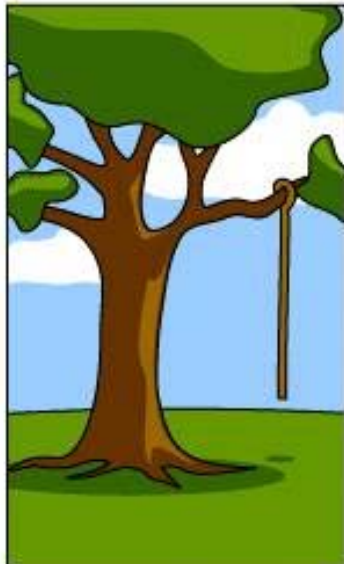
What operations installed