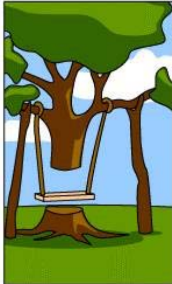
How the Analyst designed it