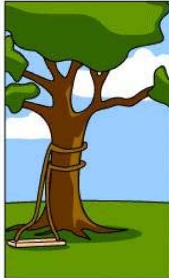
How the Programmer wrote it