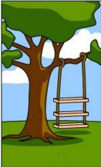
How the customer explained it