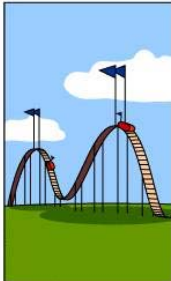
How the customer was billed