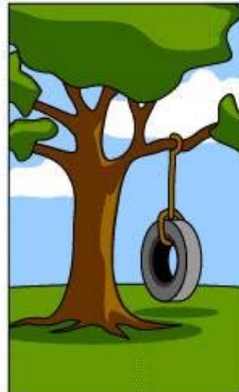
What the customer really needed